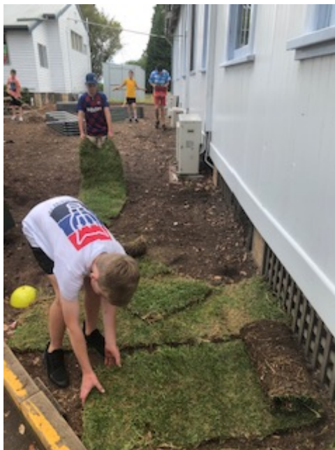
Laying some turf we found!