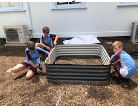
Assembling the garden beds