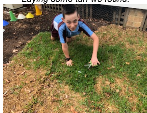
Cutting the grass