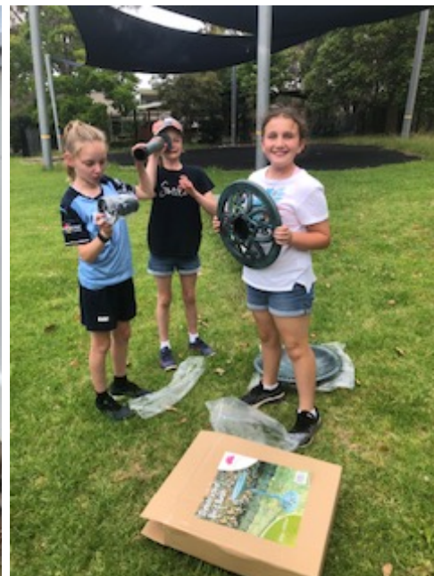
Assembling a bird bath