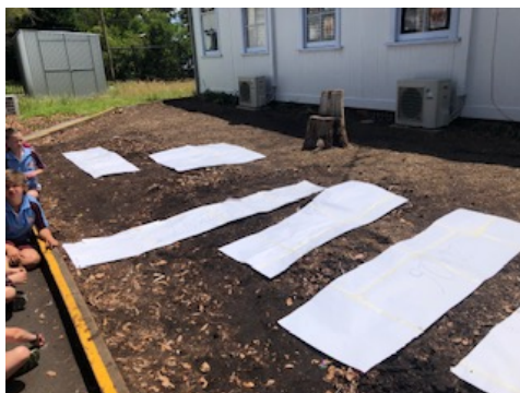
Deciding on the different garden bed designs