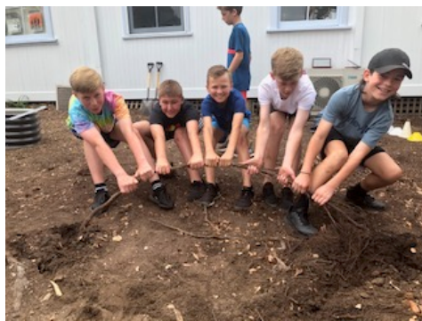
Preparing the ground

We are continuing to work on improving Area 3. We have cleared the area and have assembled some garden beds. We needed to use our maths skills to calculate the area of the various design combinations. We finally agreed and were able to start assembling with the help of Victor. We also saved some extra turf we found. We are so proud to see how the grass is (mostly) a beautiful shade of green... even requiring a little bit of grass cutting soon!